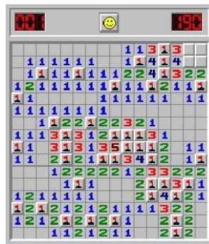
Figure 1.1.: A Minesweeper Configuration

Consider Figure 1.1 which shows a typical configuration that may appear during a play of Minesweeper: 2